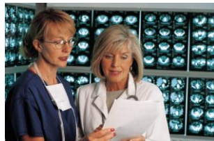
DST will leverage its scientific expertise to provide multi-phase studies and models